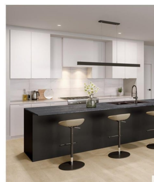
UPGRADE HOOD FAN BUILD OUT VANILLA / FLAT PANEL